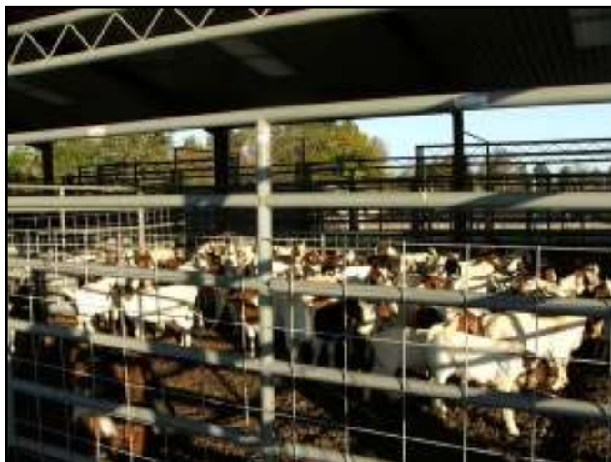
363 heads of goat and sheep were sold our October 22, 2011 sale.

The Classifieds posted in the newsletter are copied from the website. No photo will be placed in the newsletter.